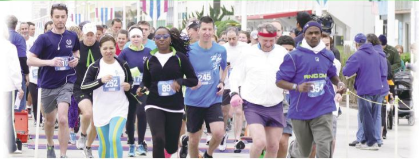
JEWISH FAMILY SERVICE OF TIDEWATER

The JFS Run, Roll or Stroll is a fundraising event to benefit Jewish Family Service of Tidewater Inc. JFS is a non-profit agency that provides an extensive array of social services, including home health, counseling for adults and children, and Meals on Wheels to people of all faiths in Tidewater.